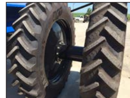
46" Duals for high clearance, less compaction.