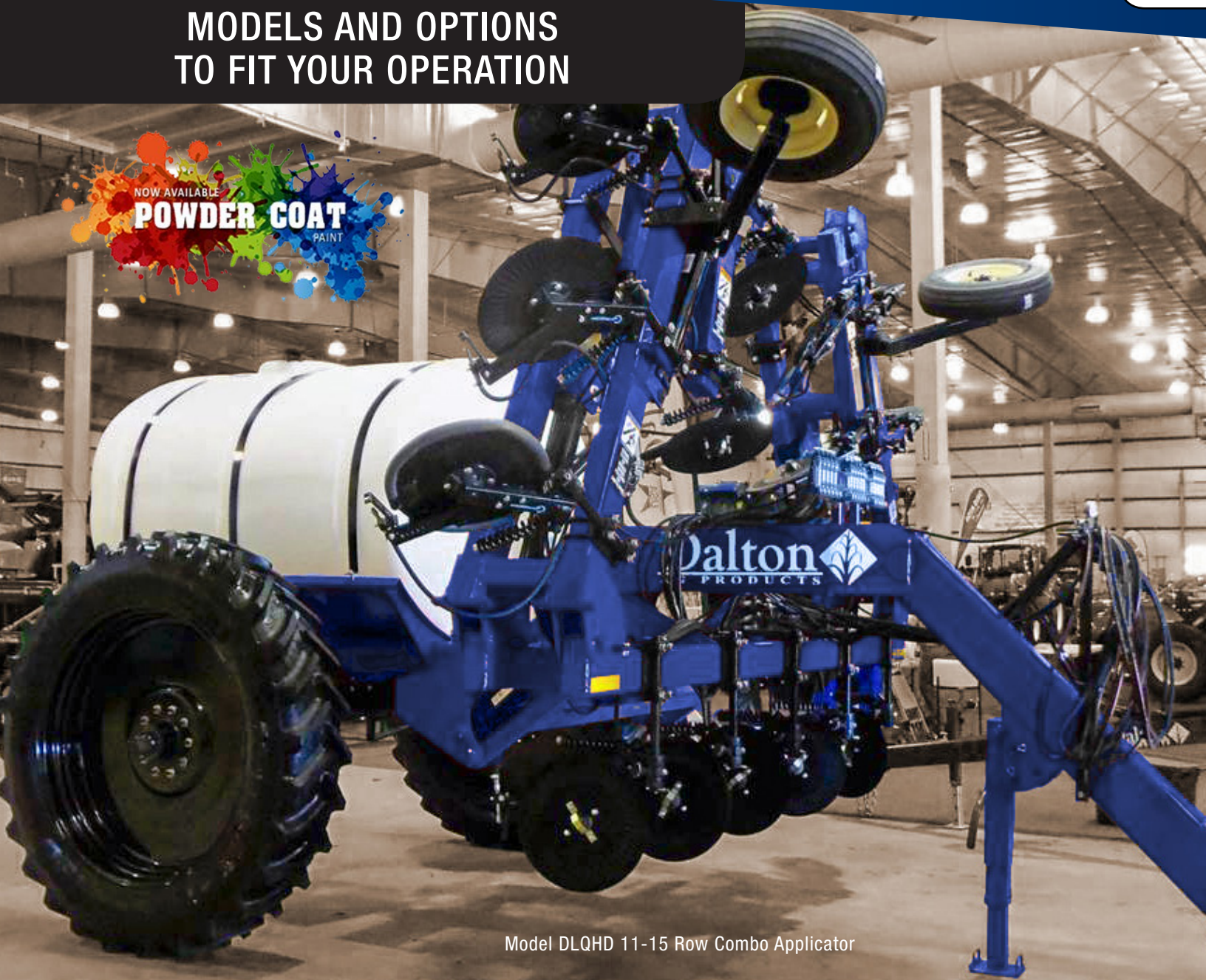
Model DLQHD 11-15 Row Combo Applicator