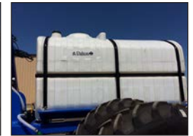
Steel reinforced 1,500 gallon narrow poly tank.