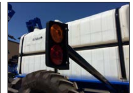
DOT compliant full-width lighting kit standard.