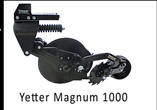
Yetter Magnum 1000