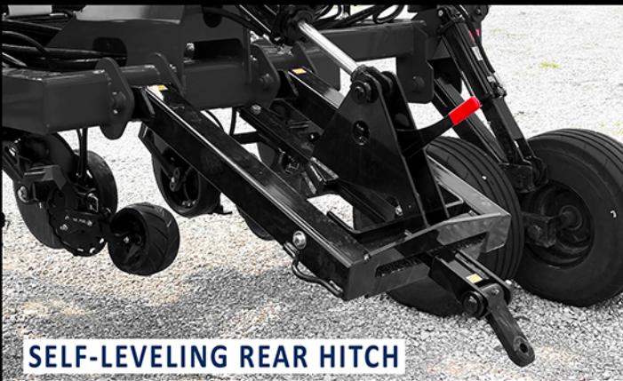
SELF-LEVELING REAR HITCH